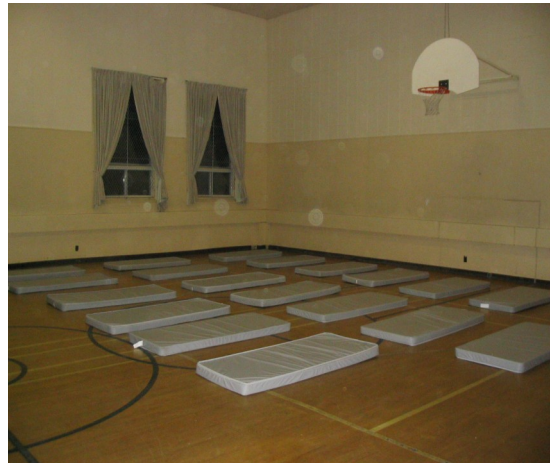
Jan 2004—Church Gymnasium in Edmonton opened as Emergency Shelter due to lack of space at a cost of $1200 / night.

With significantly less funding than contributed to the emergency and transitional shelter industry, many more single room homes could be built to meet the core housing needs of adult singles. These homes would be safe, suitable for single occupancy, and affordable. Typically, government preferred recipients of affordable housing for singles have been non-profit and have received $60,000-80,000 per unit from various taxpayer paid granting sources. Private busi-